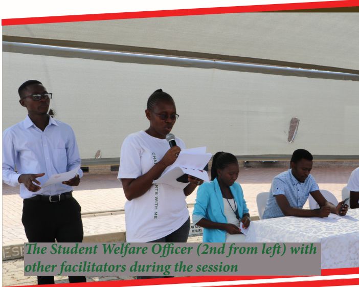
The Student Welfare Officer (2nd from left) with other facilitators during the session