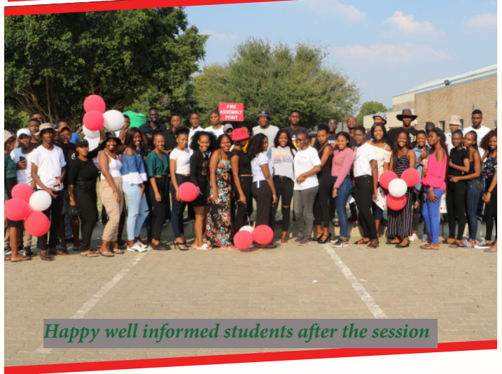
Happy well informed students after the session

BUAN is one of the universities in Botswana populated by youth who are at risk of unhealthy sexual behaviour. In celebrating the month of Love, the office of Student Welfare hosted a valentine's day for students under the theme: Sexual responsibility-My valentine.