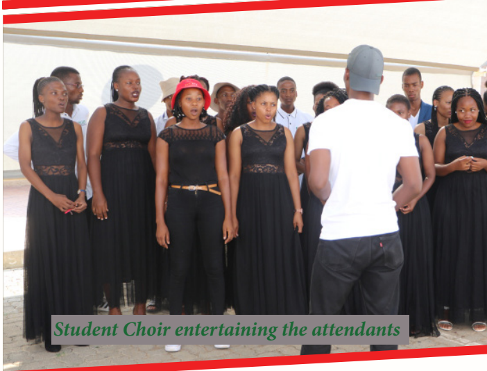
Student Choir entertaining the attendees