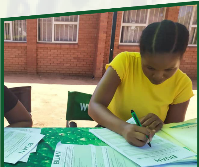
Prospective students filling application forms during roadshows