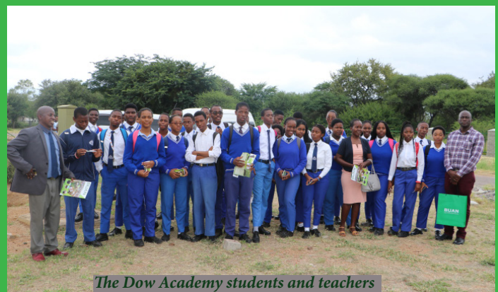
The Dow Academy students and teachers

The school was later engaged at the farm to view the various farm implements and had the opportunity to learn more about beef and dairy productions. In evaluation of the trip, students and teachers appreciated the tour and it is likely that through this exercises BUAN can anticipate enrolment for 2021 and 2022 from the Dow Academy.