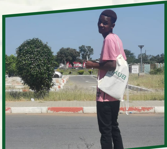
Happy BUAN prospect after submitting forms