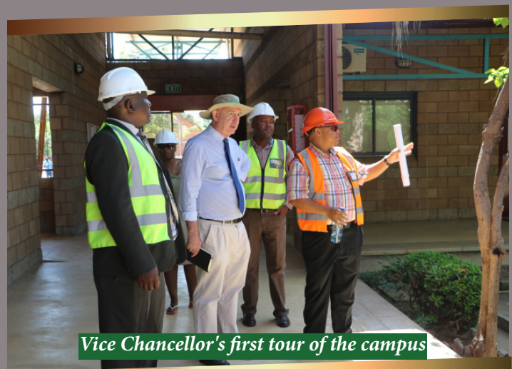
Vice Chancellor's first tour of the campus