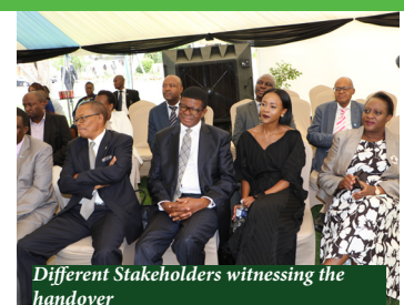
Different Stakeholders witnessing the handover