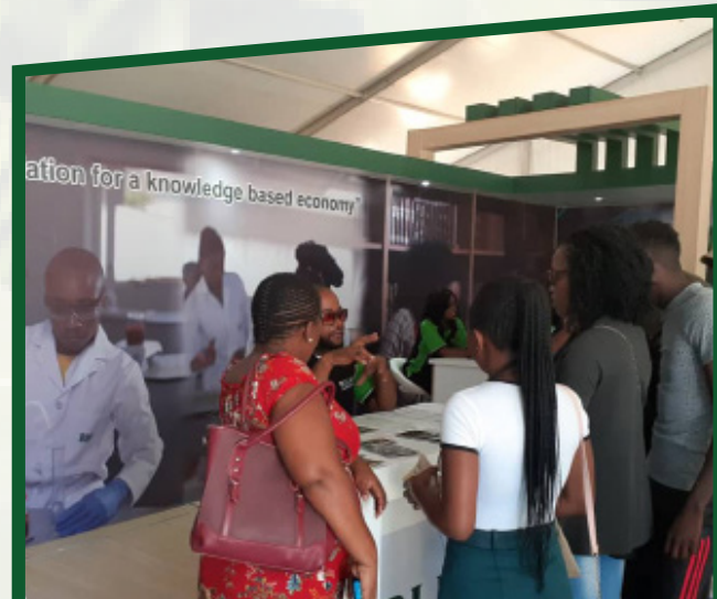
BUAN staff explaining requirements to prospective students and parents during Francistown BHRDC Fair

Botswana University of Agriculture and Natural Resources (BUAN) went all out to attract and enrol the best brains of prospective tertiary learners. The BUAN teams ensured that they were not just recruiting students but also giving them comprehensive career guidance on opportunities in the Agriculture and Natural resources industries. The University had three teams embarking on a national roadshow and also joined the BHRDC fairs in Francistown and Maun which were held on the 24-28th February 2020 and