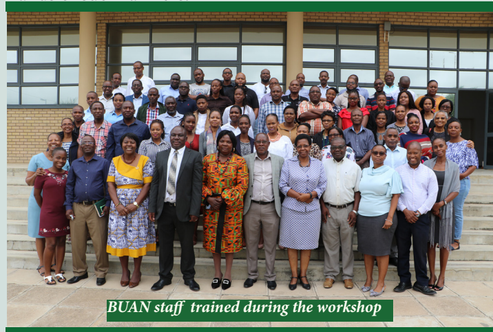
BUAN staff trained during the workshop

Destroying a nation does not only require the use of an atomic bomb or the use of long range missiles, it can also be destroyed by lowering the quality of education and allowing cheating in examinations. e.g patients die at the hands of such doctors; buildings collapse at the hands of such engineers; money is lost at the hands of such economists and accountants and in the case of BUAN, poor education quality would mean the nation stores are at the hands of such farmers.