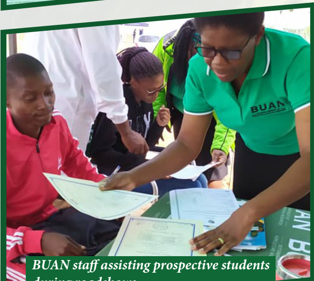
BUAN staff assisting prospective students during roadshows