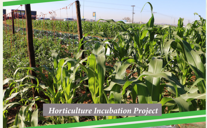
Horticulture Incubation Project

BUAN has adapted a Financial model, which is currently built around commercialising MITI, CICE and the Farmland portions, which will be used to incubate our students and will create employment opportunities for the graduates. This model is driven through partnerships with the private sector and other Universities. It will mostly be driven through two 100% subsidiaries of the University, namely; BUAN Enterprises (Pty) Ltd and BUAN Consult (Pty) Ltd. This arrangement is called smart partnerships, whereby, each partner invests what they have as comparative advantage in the venture. BUAN in this case, has an advantage of land and facilities which have not been exploited commercially and present an opportunity to the private sector for revenue creation. BUAN also has a lot of expertise who will be offering technical advice to the ventures in-house.