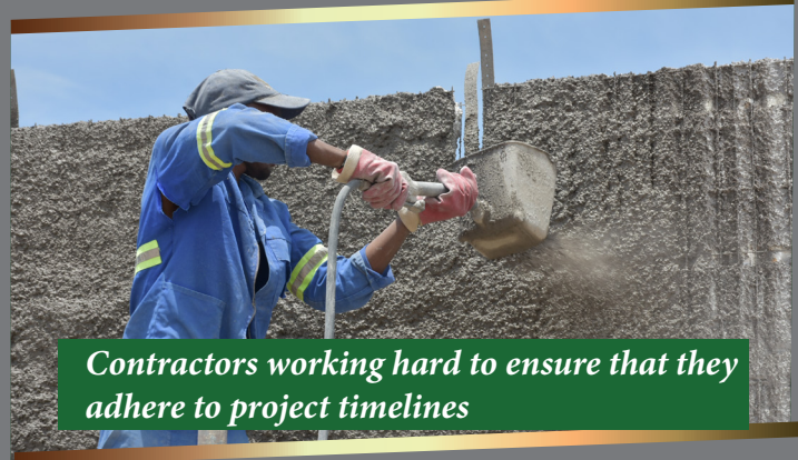
Contractors working hard to ensure that they adhere to project timelines